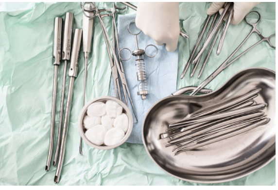
In Switzerland, 75% of abortions are carried out before the eighth week, via pills rather than surgery

On Sunday afternoon, the GfS Bern research and polling institute predicted that just 30% of voters, +/- 3%, would vote in favour of the initiative. Backed by an inter-party committee made up essentially of conservative Christians, the people's initiative was signed by about 110,000 voters – making it eligible for a popular vote.